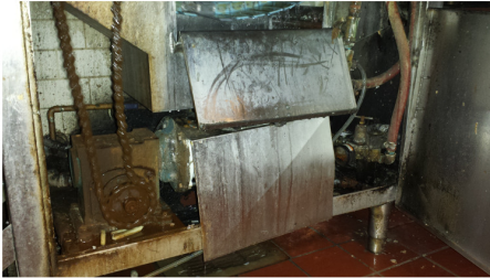
OLD MOTOR HOUSING