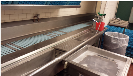
OLD SLATS & TROUGH