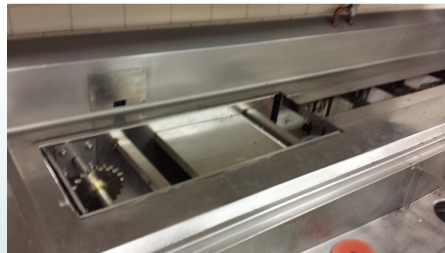
ADDING THE NEW RETURN