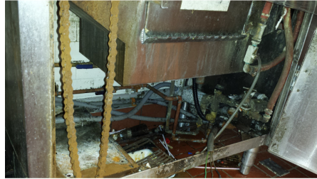
TAKING OUT THE OLD BELT WASHER