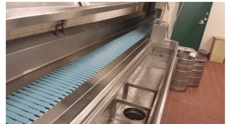
NEW BED & BELT