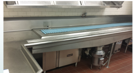
NEW CONVEYOR & TABLES