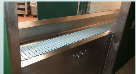
NEW DROP-OFF WINDOW