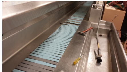
BEGINNING THE DEMO