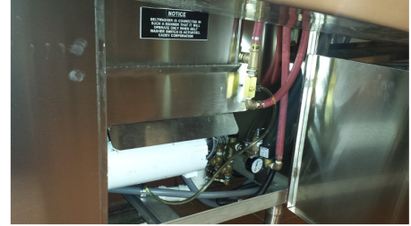
NEW BELT WASHER