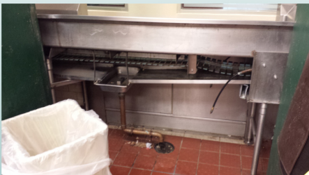
OLD DRIP TRAY