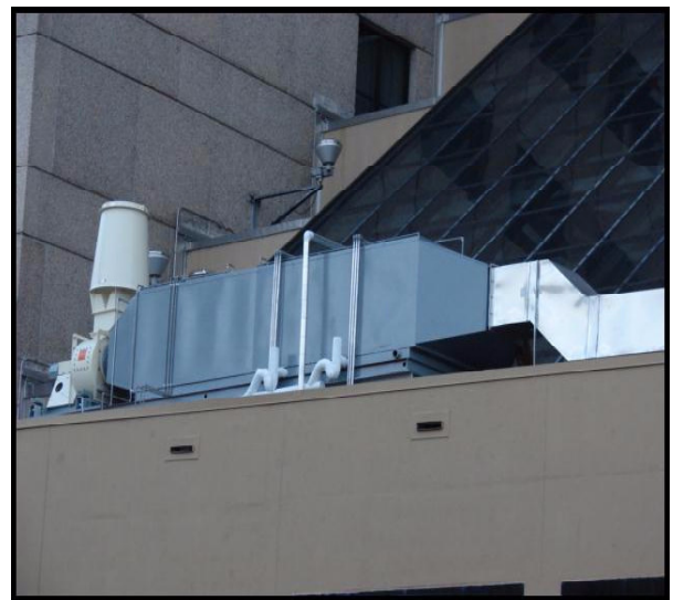
12,000 cfm CAS Rooftop Installation