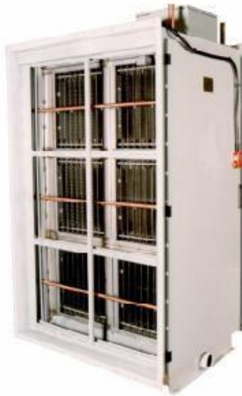
ESP (metal mesh mist eliminators removed)