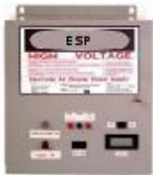
HIGH VOLTAGE POWER