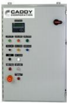
SYSTEM PLC CONTROL