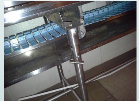
NEW DRIP TRAY & ROLLERS