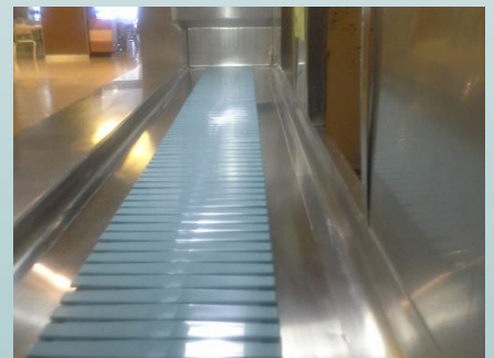
NEW DROP OFF AREA