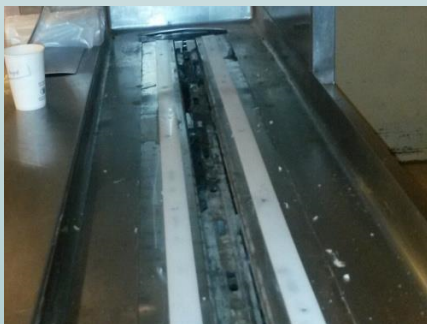
OLD DROP OFF AREA