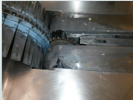
PULLING RETURN COG & WORN STAINLESS