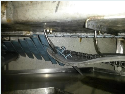
MANGLED TURN COMPONENTS, ROLLERS & BELT