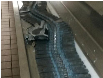
BELT TOTALLY OFF TRACK