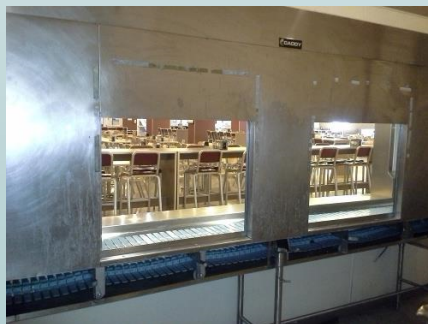
CHANGING OUT DROP OFF AREA