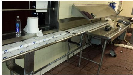
ADDING NEW BED