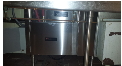
NEW MOTOR & HOUSING