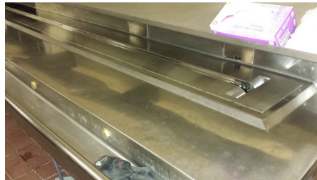
ADDING TROUGH & EYE