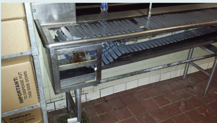
OLD BELT & RETURN