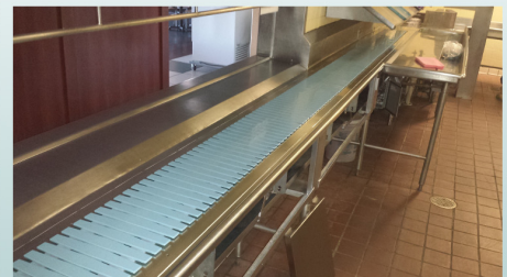
NEW BELT & WINDOW