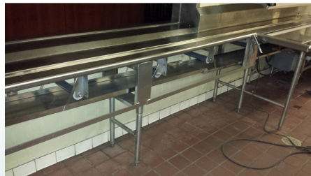
ADDING DRIP TRAY