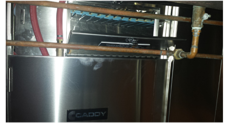
NEW BELT WASHER