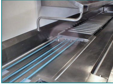
Band and Roller Conveyor