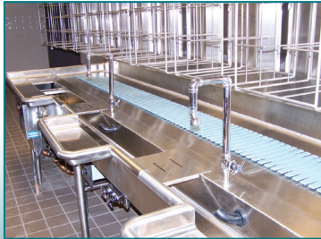
Slat Belt And Scrapper Trough